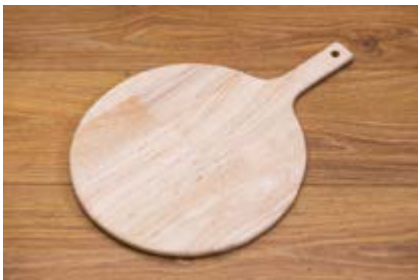
Pizza Serving Bat 12"