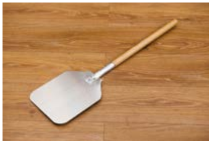
Pizza Peel 9" - Long