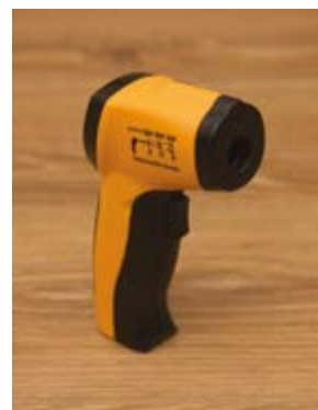
Temperature Gun - Infrared Thermometer

Please note that the model may vary from image shown.