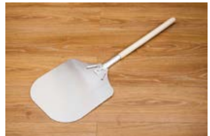
Pizza Peel 12" - Long