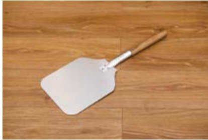
Pizza Peel 9" - Short