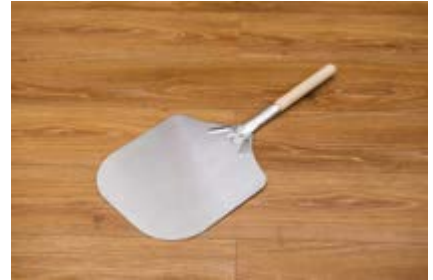
Pizza Peel 12" - Short